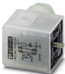
Valve connectors, 3-position, Valve connector A, with 1 LED, connected with Varistor and rectifier, Screw connection, cable gland Pg9, external cable diameter 6 mm ... 8 mm

Please be informed that the data shown in this PDF Document is generated from our Online Catalog. Please find the complete data in the user's documentation. Our General Terms of Use for Downloads are valid ( http://phoenixcontact.com/download )