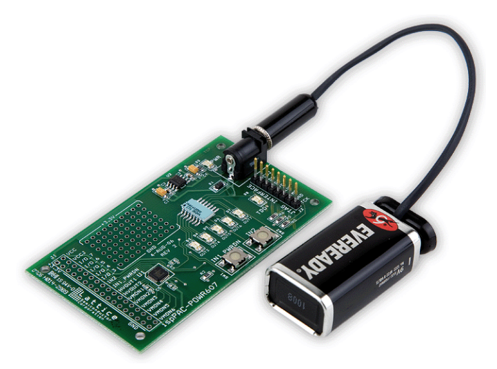
Figure 2. 9V Battery Power Interface

The ispPAC-POWR607 device operates with analog and digital core power supplies of 3.3V, To simplify evaluation work, the evaluation board was designed to operate from a single 4.5V to 9V power supply, which may be brought in through a standard 5mm power plug (J2 - center tip positive). The evaluation board provides a linear regulator to provide the appropriate operating voltages for the ispPACPOWR607 device, as well as reverse polarity protection. The kit comes with a battery and cable that plugs into the connector at J2 and provides power with a 9V battery, see Figure 2. If it is desired to test the current in the power down mode of the ispPAC-POWR607, the link between pins 3 and 4 of J1 should be cut (please refer to Appendix A). Otherwise, approximately 2mA will be drawn when the device is in power down mode.